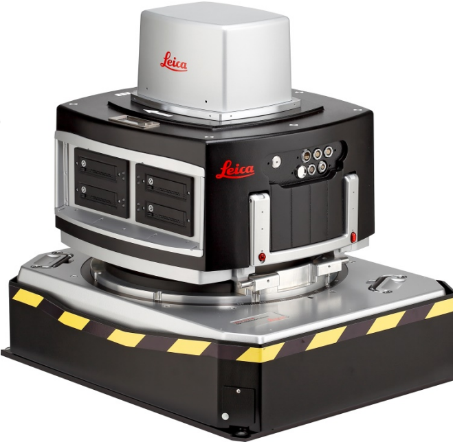
Figure 1 – Leica DMC3 with PAV100 Stabilized Mount and IMU

Due in part to a smaller pixel size (3.9\mu m) , the DMC3 is capable of acquiring very accurate data with less building lean compared to other sensors. As an example, for a GSD of 10 cm we are flying much higher than previously (2300m - approximately 7700 feet). This capability also means that a larger area can be captured in a single photo at the same GSD, reducing flight time and production costs while increasing the accuracy of the final product.