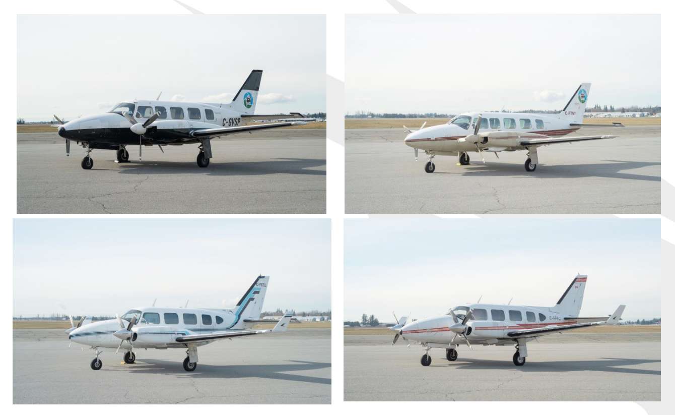
Figure 2 - Peregrine's Aircraft Fleet

The modifications to, and sensor installations in, all our aircraft are approved as per Transport Canada regulation CAR 521.152. Without this approval, such changes to aircraft invalidate the Certificate of Airworthiness and therefore the insurance coverage. The approval also ensures that the equipment and aircraft can be operated normally without damage. Our commitment to safety separates us from the majority of providers.